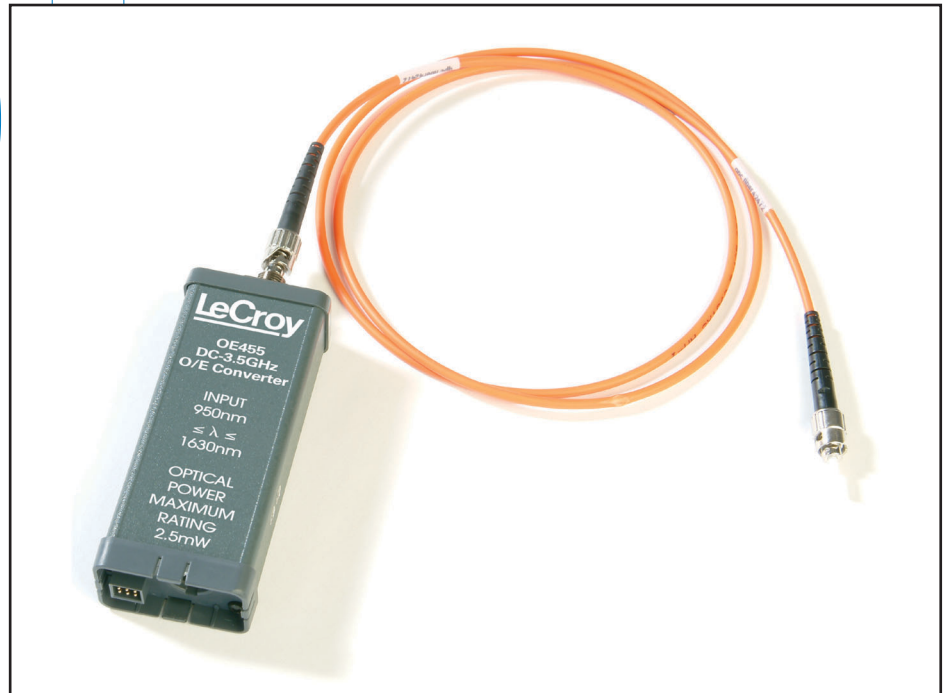
OE455 optical-to-electrical converter shown with multi-mode fiber jumper attached.

The OE425 and OE455 are wide-band multi-mode optical-to-electrical converters designed for measuring optical communications signals. Their broad wavelength range and multi-mode input optics make these devices ideal for applications including Gigabit Ethernet and Fibrechannel, as well as SONET/SDH up to 2.5 Gb/s.